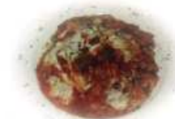
Sausage Pepper Parmigiana